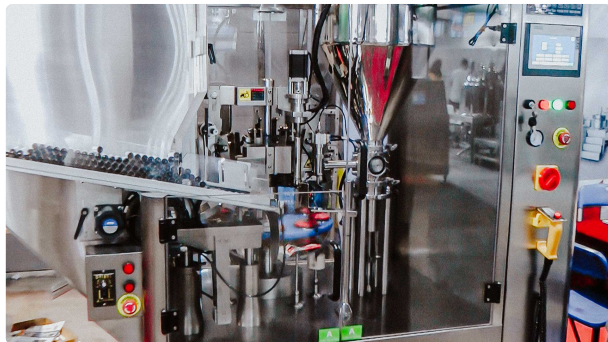
Plastic tubes cream filling machine and sealing edge puts shelf life

Pharmaceutical Tablet Press • 02.09.2020 • 2.309K views