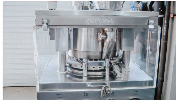
Automatic rotary tablet press for pharmaceutical tablet pressing

Pharmaceutical Tablet Press • 02.09.2020 • 2.309K views