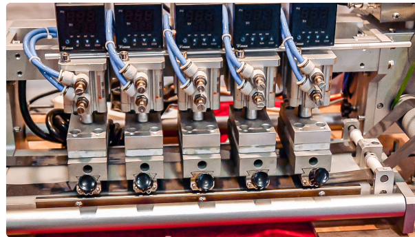
Automatic equipment for printing the shelf life on roll materials Germany

Pharmaceutical Tablet Press • 24.11.2020 • 74.400K views