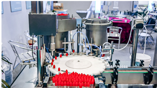
Automatic equipment for bottling and capping of plastic bottles and automatic feeding of...

Pharmaceutical Tablet Press • 24.11.2020 • 74.400K views