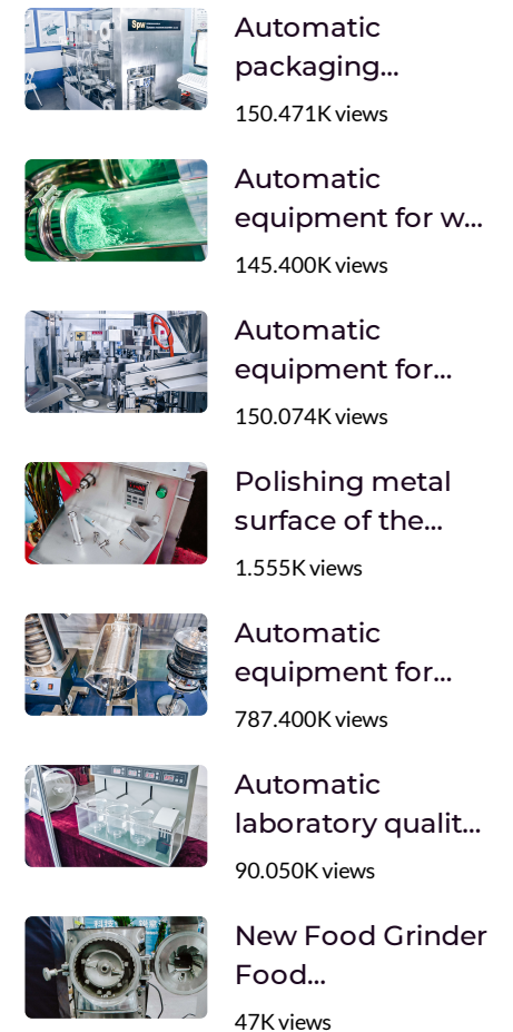
Automatic blister packaging equipment in cardboard boxes in pharmaceutical production