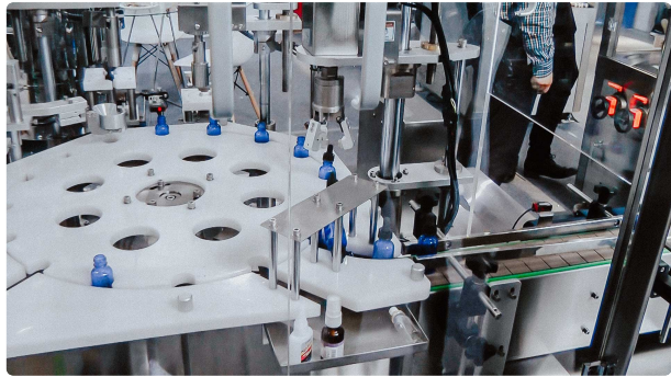
Plastic bottle filling and capping line with screw caps for liquids

Pharmaceutical Tablet Press • 31.08.2020 • 2.709K views