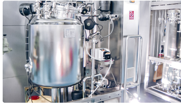
Automatic equipment for obtaining extracts of medicinal plants in pharmaceutical production

Pharmaceutical Tablet Press • 31.08.2020 • 2.709K views