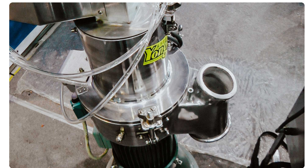
Table mills to prepare the powder from the medicine raw material for tablets and capsules

Pharmaceutical Tablet Press • 26.11.2020 • 74.505K views