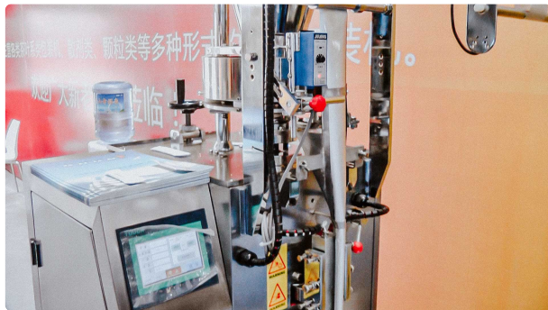
Automatic packaging machine for packing powder into sachet bags India

Pharmaceutical Tablet Press · 07.09.2020 · 758 views