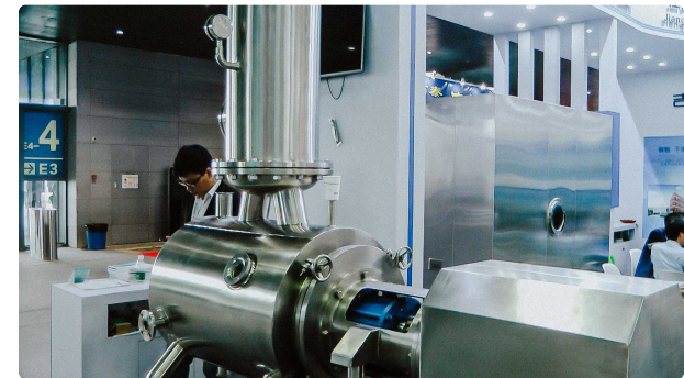
Equipment for pharmaceutical preparation of liquids for drug production

Pharmaceutical Packaging · 21.09.2020 · 8.450K views