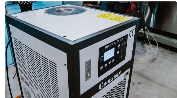
Pharmaceutical cooler to work with various packaging equipment

Pharmaceutical Tablet Press · 07.09.2020 · 980 views