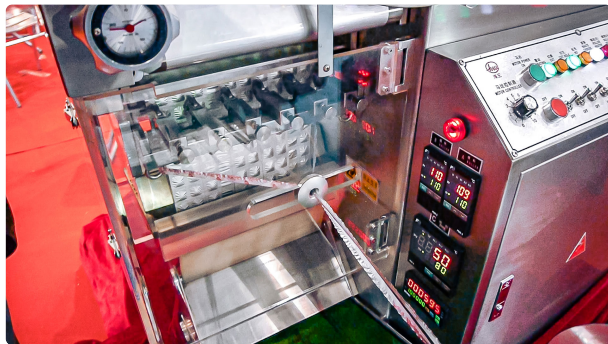
Automatic equipment for tablet packing in soft aluminum packaging

Pharmaceutical Tablet Press · 23.11.2020 · 45.410K views