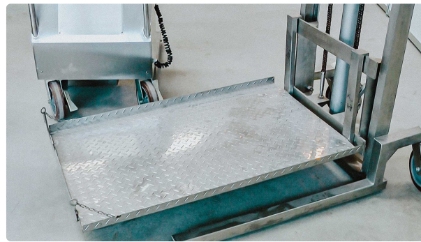
Automatic pick-up for powder containers in pharmaceutical factory

Pharmaceutical Tablet Press · 03.09.2020 · 1.750K views