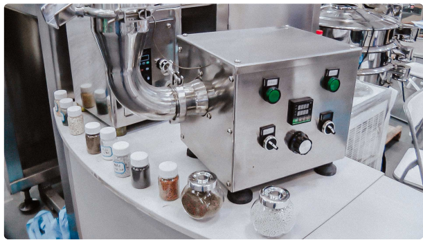
Laboratory machine granulator with powder and granule drying system

Pharmaceutical Tablet Press · 03.09.2020 · 1.750K views