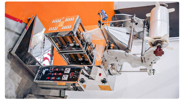
Automatic equipment for packing powders into plastic bags

Pharmaceutical Packaging · 17.09.2020 · 18.795K views