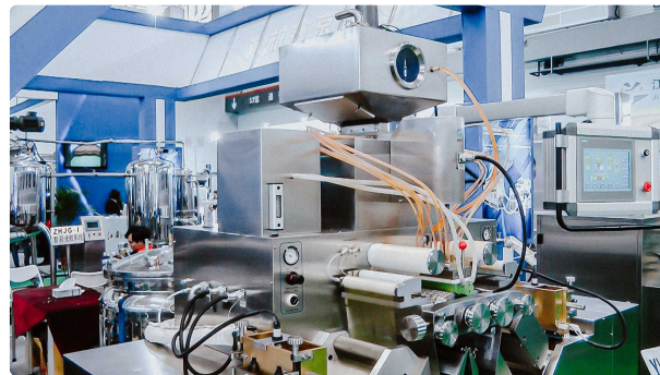
Automatic equipment for the production of oval soft gelatin capsules with oil Pharmaceutical Packaging · 18.09.2020 · 10.245K views