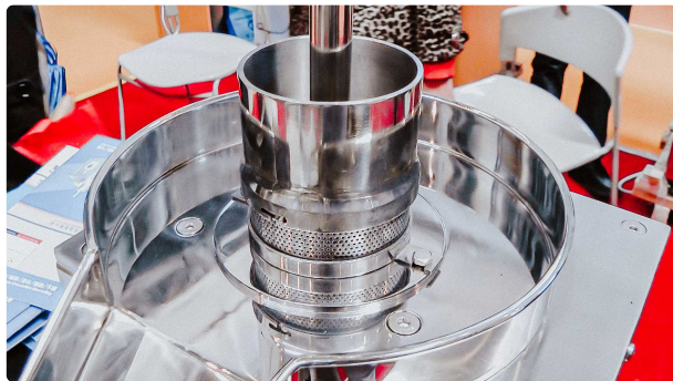
Laboratory wet powder granulator for pellet production in pharmaceutical factory Pharmaceutical Packaging · 25.09.2020 · 97.710K views