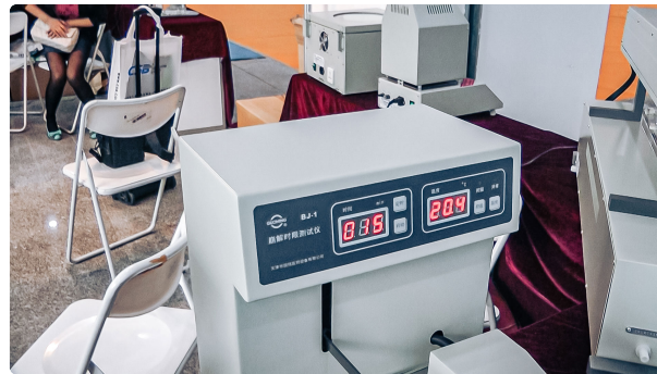
Automatic tablet quality testing equipment for laboratory decomposition in pharmaceutical...

Pharmaceutical Tablet Press • 24.11.2020 • 115.700K views