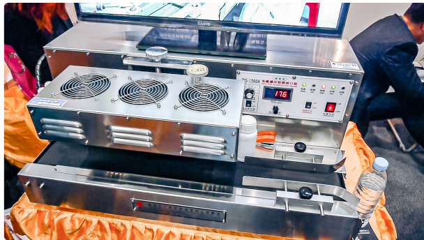
Automatic equipment for aluminum membrane solder induction to the bottle neck

Pharmaceutical Tablet Press • 24.11.2020 • 115.700K views