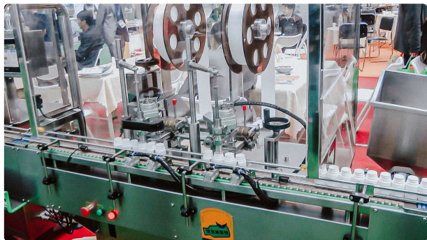
Automatic line for filling and packaging of tablets in plastic bottles with caps

Pharmaceutical Packaging • 15.09.2020 • 1.255K views