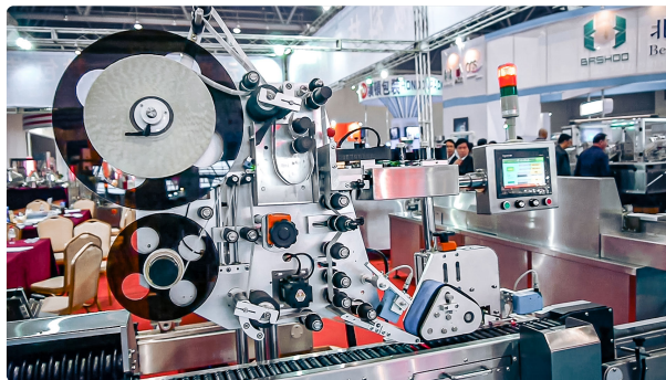
Automatic labeling equipment for sticking labels on penicillin bottles

Pharmaceutical Packaging • 15.09.2020 • 1.255K views