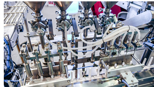
Automatic equipment for filling and capping plastic syringes

Pharmaceutical Tablet Press • 20.11.2020 • 750K views