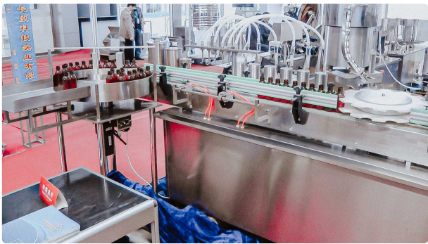
Automatic liquid bottling and capping machine in plastic bottles with screw cap

Pharmaceutical Packaging • 15.09.2020 • 980 views