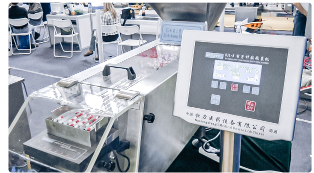
Automatic equipment for gelatine capsules counting and filling of bottles in pharmaceutic...

Pharmaceutical Tablet Press • 07.12.2020 • 79.500K views