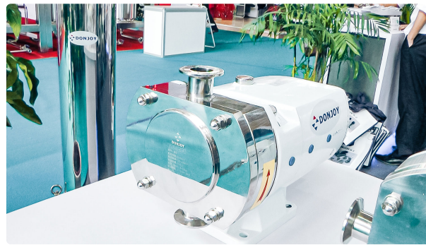
Automatic equipment for pumping liquids in pharmaceutical production Poland

Pharmaceutical Packaging • 15.09.2020 • 980 views