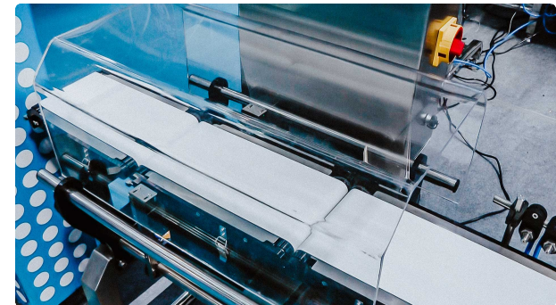
Automatic equipment for weight control of packages with tablets, gelatin capsules or...

Pharmaceutical Tablet Press • 14.09.2020 • 1.645K views