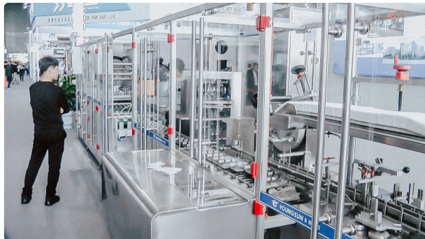
High speed packing of glass ampoules into plastic containers and blisters

Pharmaceutical Packaging • 15.09.2020 • 950 views