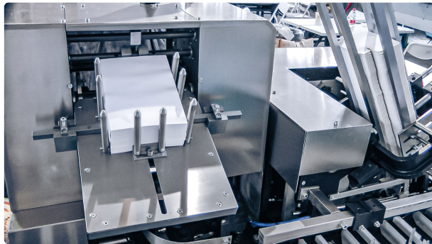
Automatic equipment cardboard machine penicillin bottles in pharmaceutical production Pharmaceutical Tablet Press · 02.12.2020 · 50.790K views