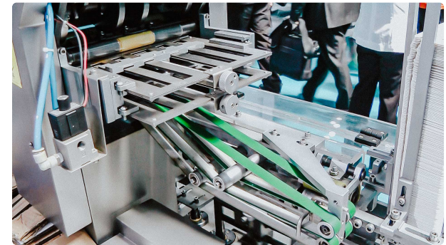
Automatic cartoning machine for packing powders in plastic bags sticks packaging bliste... Pharmaceutical Packaging · 23.09.2020 · 125.400K views