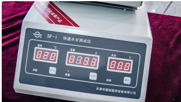
Automatic pellet speed testing equipment in pharmaceutical production Greece

Pharmaceutical Tablet Press • 09.12.2020 • 59.700K views