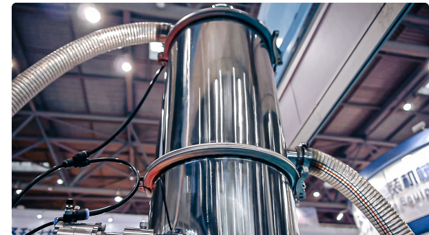
Automatic equipment for vacuum conveying of powders and capsules

Pharmaceutical Packaging • 18.09.2020 • 9.578K views