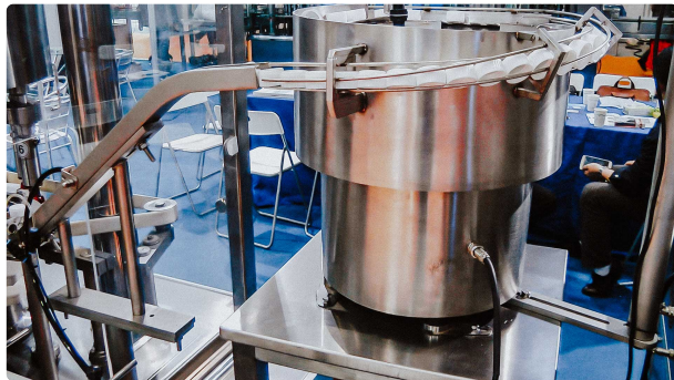
Automatic bottling and capping machine plastic bottles and screw caps

Pharmaceutical Packaging • 21.09.2020 • 11.504K views