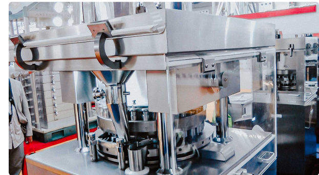
Large automatic rotary tablet press for the production of various forms of tablets

Pharmaceutical Tablet Press • 07.09.2020 • 1.450K views