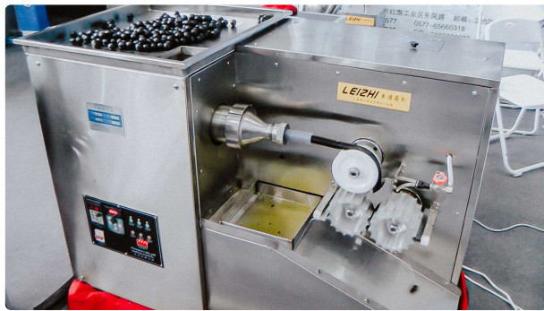
Ball preparation equipment made of dough or soft caramel for Chinese medicine

Pharmaceutical Tablet Press • 01.09.2020 • 1.505K views