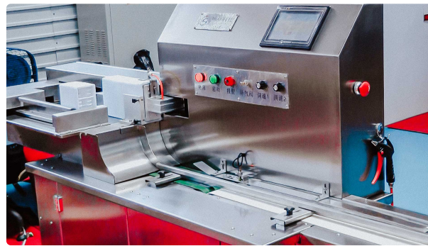
Automatic machine for packing glass ampoules in plastic containers of 10 pieces

Pharmaceutical Tablet Press • 01.09.2020 • 1.505K views