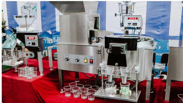
Equipment for counting and packaging of tablets, dragee, pills, capsules, candies

Pharmaceutical Tablet Press • 28.08.2020 • 2.054K views