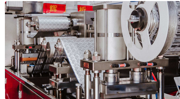
High speed automatic blister packaging machine for blister hard gelatin capsules

Pharmaceutical Tablet Press • 04.09.2020 • 1.470K views