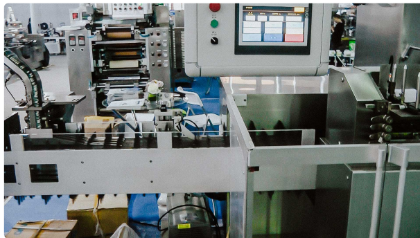
High speed cardboard machine with blister and tube paving

Pharmaceutical Tablet Press · 11.09.2020 · 1.758K views