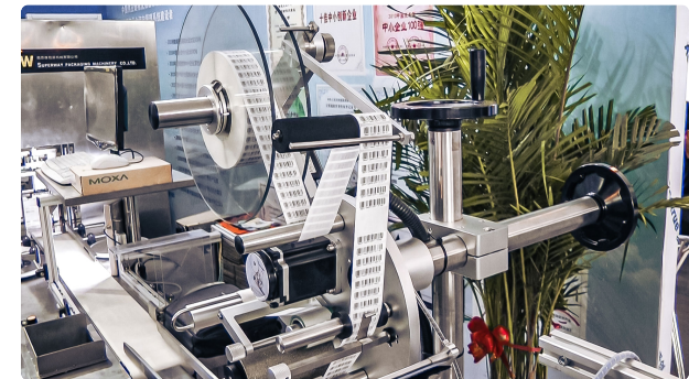
Automatic equipment packaging of cardboard boxes in cellophane in pharmaceutical...

Pharmaceutical Packaging · 23.09.2020 · 85.010K views