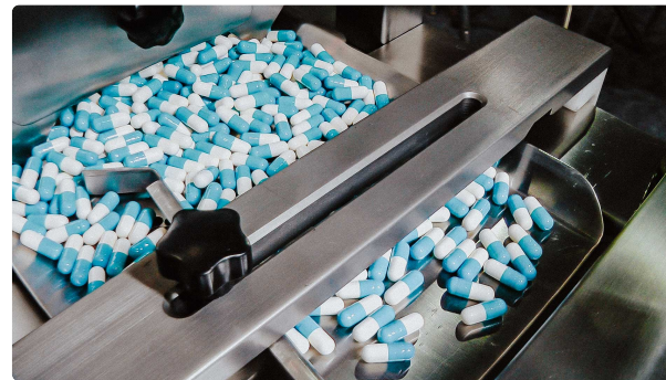
The table is illuminated for visual control the operator the quality of hard gelatin capsules

Pharmaceutical Tablet Press · 11.09.2020 · 1.758K views