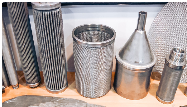
Automatic equipment for stainless steel filters in pharmaceutical production

Pharmaceutical Tablet Press • 11.09.2020 • 1.787K views