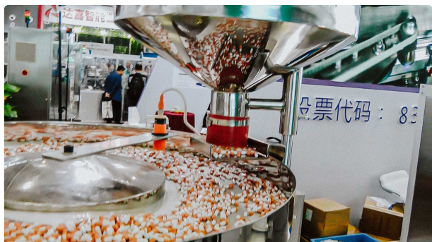
High speed automatic blister packaging machine for PVC and ALU blister solid gelatin...

Pharmaceutical Tablet Press • 11.09.2020 • 1.787K views