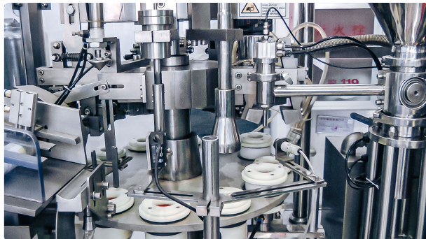
Automatic equipment for filling of cream and ointment in plastic tubes of pharmaceutical...

Pharmaceutical Tablet Press • 30.11.2020 • 79.950K views