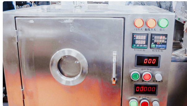
Automatic microwaves chamber for heating and evaporation of medicinal plant extracts

Pharmaceutical Tablet Press • 30.11.2020 • 79.950K views