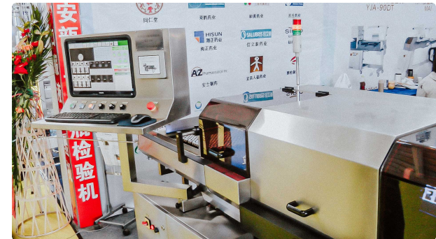
Automatic machine visual quality control of penicillin vials and ampoules

Pharmaceutical Packaging • 25.09.2020 • 100.500K views