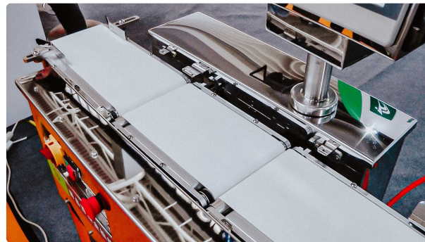
Conveyor scales for controlling the weight of drug packages in pharmaceutical production

Pharmaceutical Tablet Press · 03.11.2020 · 57.410K views