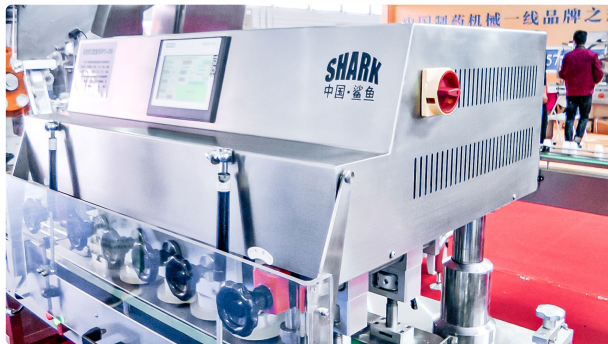
Automatic equipment for screwing plastic caps on plastic bottles

Pharmaceutical Tablet Press · 03.11.2020 · 57.410K views