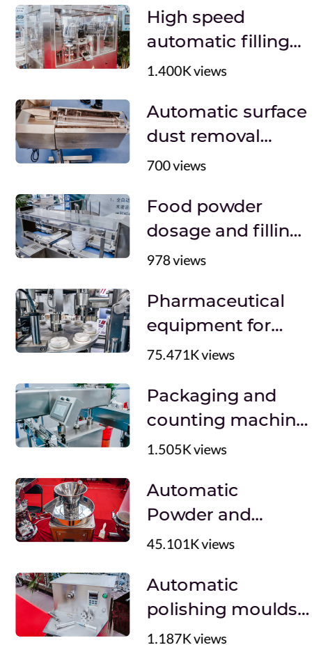
High speed automatic blister packing equipment for blister packing with hard gelatin capsules