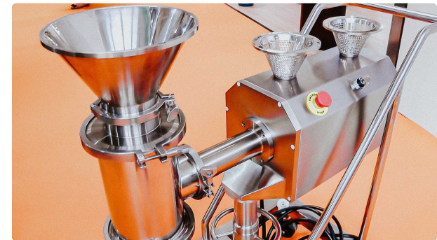
Granulator for the production of pharmaceutical granules from moistened powder

Pharmaceutical Tablet Press · 01.09.2020 · 3.590K views