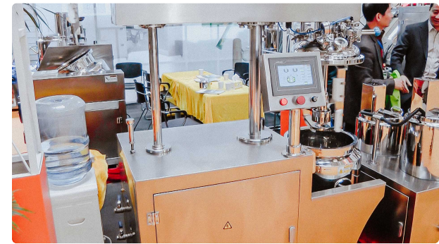
Homogenizer for preparation of cosmetic cream and ointments with heating and agitator

Pharmaceutical Tablet Press · 30.11.2020 · 47.090K views