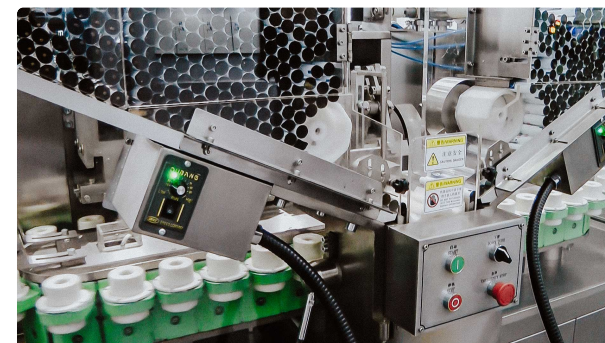
High speed automatic cream filling machine and ointment plastic tubes

Pharmaceutical Packaging • 25.09.2020 • 125.400K views