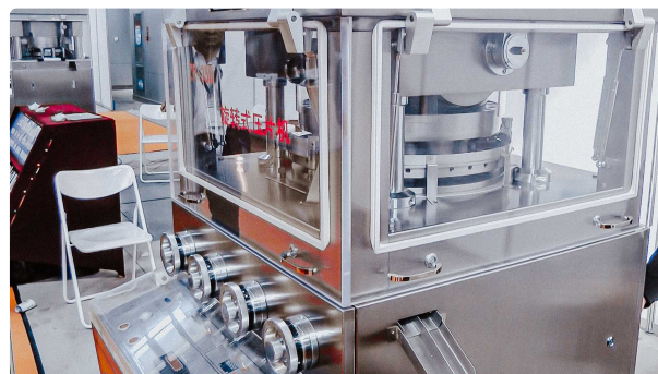
Automatic rotary tablet press for production of tablets

Pharmaceutical Tablet Press • 23.11.2020 • 450K views