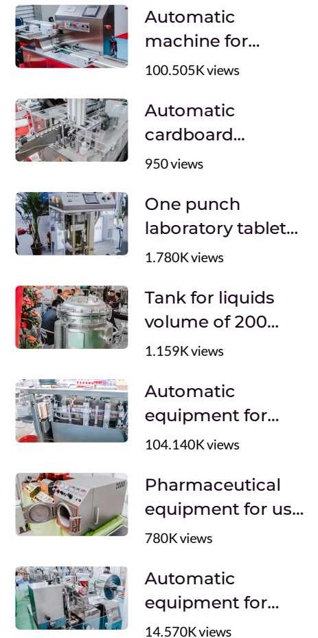
Automatic high speed packing machine for packing tea in filter bag and plastic envelope