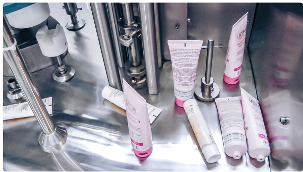
Automatic equipment for filling of cream and ointment in aluminum tubes in pharmaceuticals...

Pharmaceutical Tablet Press • 30.11.2020 • 75.410K views