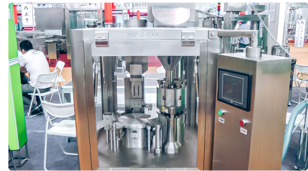
Automatic equipment for filling hard gelatin capsules with powder in pharmaceuticals...

Pharmaceutical Packaging • 22.09.2020 • 18.740K views