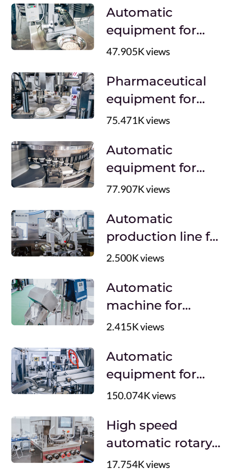
High speed automatic plastic bottles cartoning equipment for packing bottles in boxes