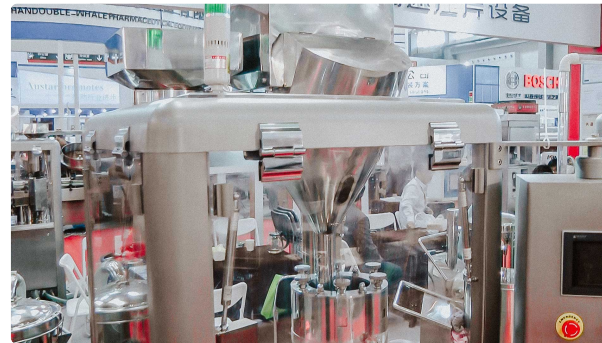
Automatic filling machine for solid gelatine capsules 00,0,1,2,3,4 with powder or granules Pharmaceutical Tablet Press • 09.09.2020 • 787 views