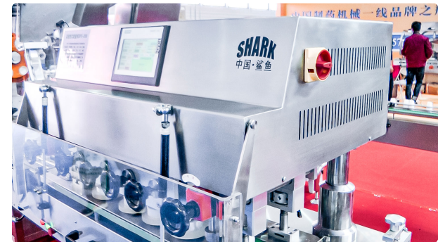
Automatic equipment for screwing plastic caps on plastic bottles

Pharmaceutical Tablet Press · 01.09.2020 · 1.555K views