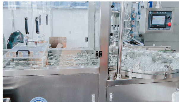
Automatic machine for washing and sterilizing glass penicillin bottles

Pharmaceutical Tablet Press · 07.12.2020 · 79.405K views