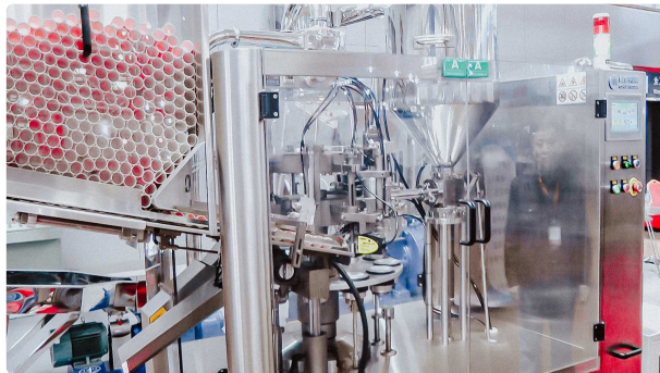
Automatic equipment for dosing and filling cream in plastic tubes with sealing

Pharmaceutical Packaging • 18.09.2020 • 4.570K views