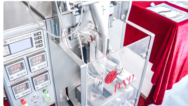
Automatic equipment for packing powders and granules into plastic bags in pharmaceutical...

Pharmaceutical Packaging • 18.09.2020 • 4.570K views