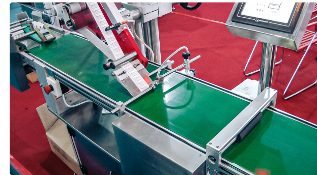
Automatic equipment to stick self-adhesive labels to boxes in pharmaceutical production

Pharmaceutical Tablet Press · 07.09.2020 · 2.025K views