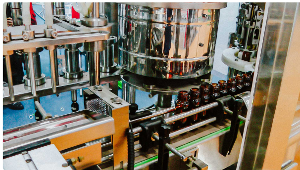
Automatic glass bottle filling and capping machine and screw caps

Pharmaceutical Packaging · 22.09.2020 · 18.980K views