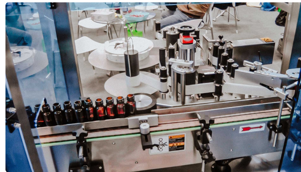
Automatic labeling machine for labelling labels on glass bottles

Pharmaceutical Packaging · 22.09.2020 · 18.980K views