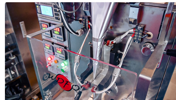
Automatic powder filling equipment in pillow bag

Pharmaceutical Packaging • 28.09.2020 • 87.500K views