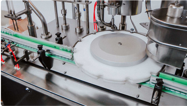
Automatic filling and closing line for penicillin bottles, rubber stoppers and aluminum caps...

Pharmaceutical Tablet Press • 07.09.2020 • 1.100K views