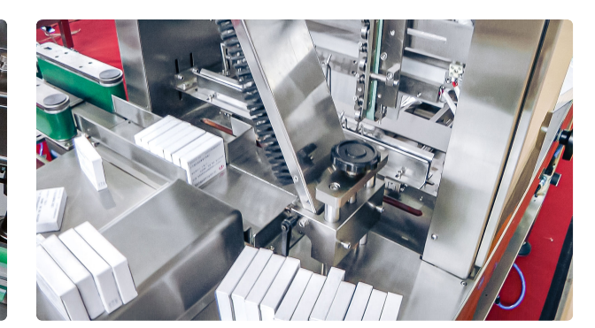
Automatic equipment cellophanator in pharmaceutical production Norway

Pharmaceutical Tablet Press • 07.09.2020 • 1.100K views