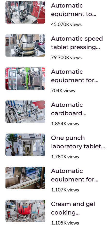
Automatic line for filling and packaging of tablets in plastic bottles with caps