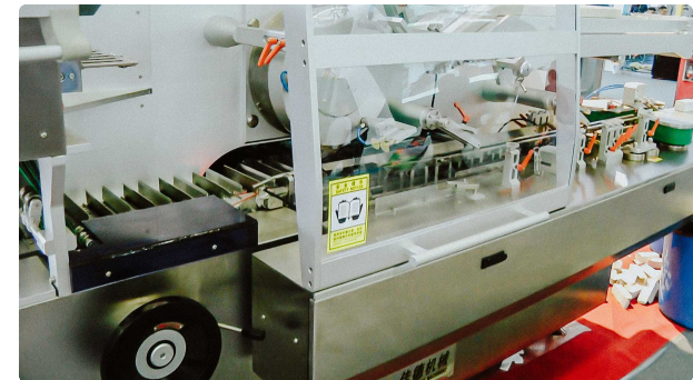
High speed automatic plastic bottles cartoning equipment for packing bottles in boxes

Pharmaceutical Packaging • 21.09.2020 • 8.945K views