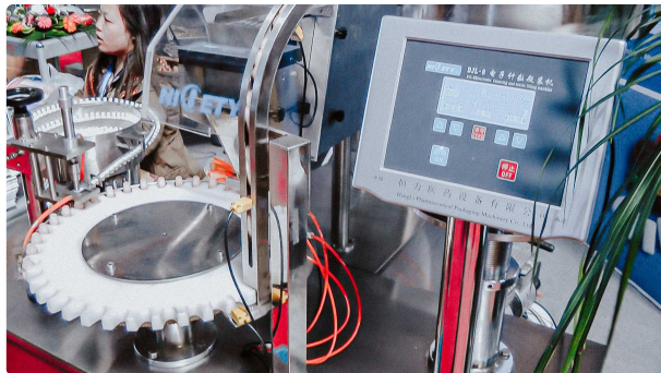
Capping and filling liquids automatic machine for pharmaceutical factory

Pharmaceutical Tablet Press • 08.09.2020 • 1.884K views