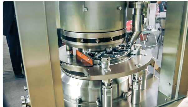
Automatic equipment for production of oval tablets in pharmaceutical production

Pharmaceutical Tablet Press · 08.09.2020 · 775 views