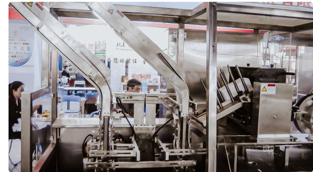
Automatic cardboard equipment for packing blister and products into boxes

Pharmaceutical Tablet Press · 10.12.2020 · 105.750K views