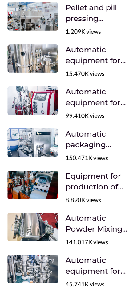
Automatic liquid dosing equipment peristaltic pumps in pharmaceutical production