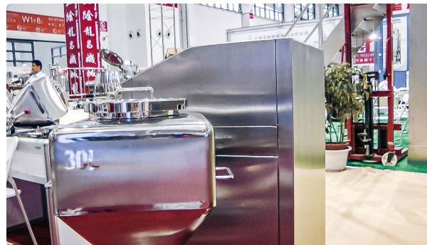
Automatic Powder Mixing Cone Equipment in Pharmaceutical Production Pharmaceutical Tablet Press · 24.11.2020 · 47.108K views