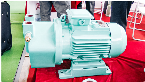
Automatic equipment for pumping liquids in pharmaceutical production European Pharmaceutical Tablet Press · 07.12.2020 · 77.554K views