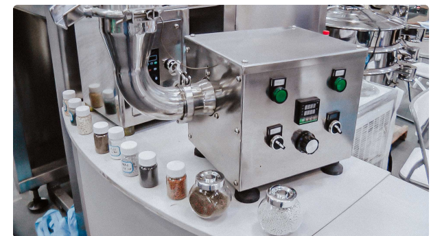
Laboratory machine granulator with powder and