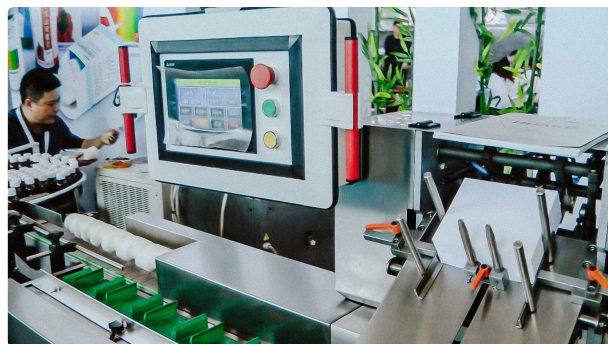
High speed automatic cardboard blister