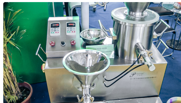
Automatic equipment for powder pelletizing by