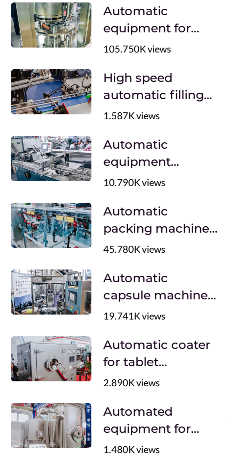
Automatic machine for washing and sterilizing glass penicillin bottles