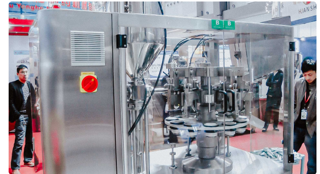
Pharmaceutical equipment for filling and sealing plastic tubes with cream and ointment

Pharmaceutical Packaging • 17.09.2020 • 7.854K views