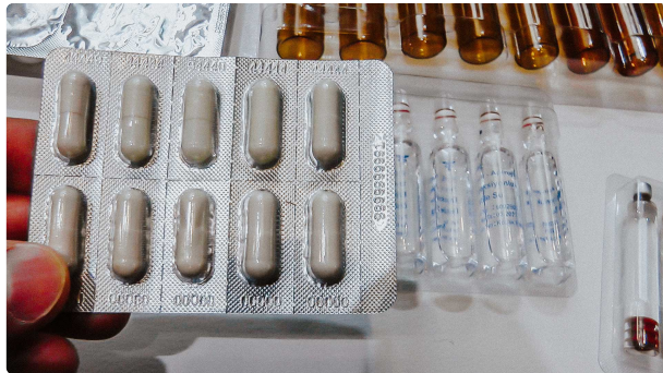
Equipment for packing solid gelatine capsules in PVC and aluminum blister

Pharmaceutical Tablet Press • 03.09.2020 • 1.785K views