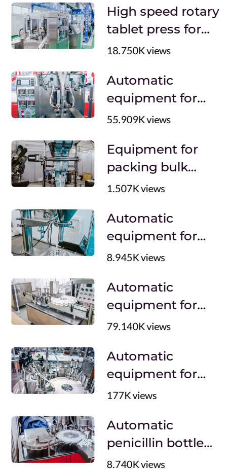
Automatic equipment for bottling and capping of 20 ml glass bottles and capping with screw caps