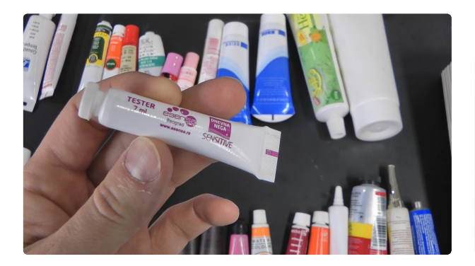
Samples plastic tubes with cream, ketchup, ointment, cream, glue and other liquid and...

Pharmaceutical Packaging • 24.09.2020 • 99.840K views