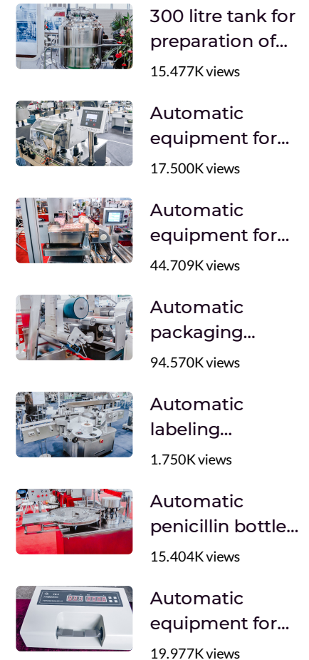
Automatic equipment for filling and capping penicillin medicine bottles for pharmaceutical industry