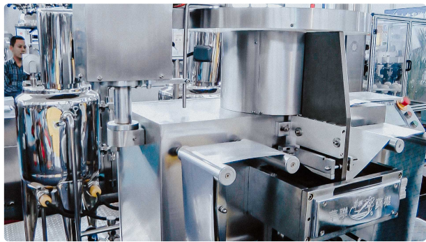
Automatic packaging machine for tablets and gelatin capsules in soft contour packaging

Pharmaceutical Packaging • 18.09.2020 • 11.500K views