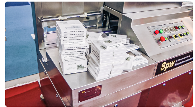
Automatic equipment packaging of plastic bottles in cellophane in pharmaceutical...

Pharmaceutical Tablet Press • 07.09.2020 • 1.605K views