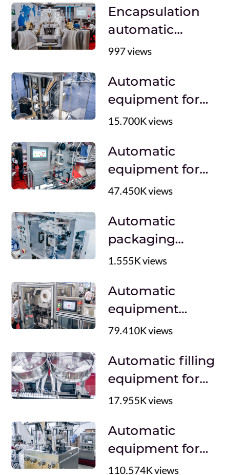
Automatic equipment for filling hard gelatin capsules with powder for drug production