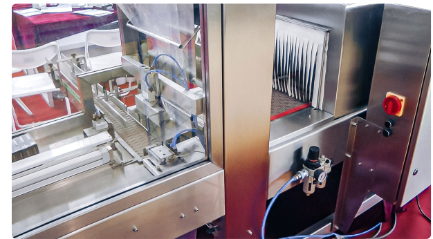
Automatic equipment for cellophane boxes packaging in pharmaceutical production

Pharmaceutical Packaging • 22.09.2020 • 20.540K views