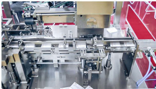
Automatic equipment Cardboard machine in pharmaceutical production

Pharmaceutical Tablet Press • 01.12.2020 • 95.410K views