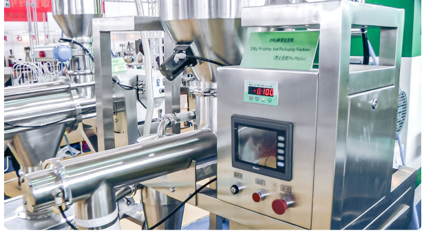
Automatic equipment for preparation and mixing of powders in pharmaceutical...

Pharmaceutical Tablet Press • 01.12.2020 • 70.090K views