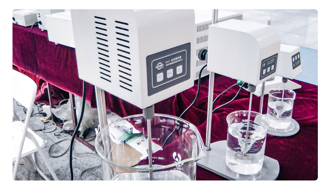
Automatic equipment for testing the dissolution rate of tablets in pharmaceutical production...

Pharmaceutical Tablet Press • 08.12.2020 • 75.410K views