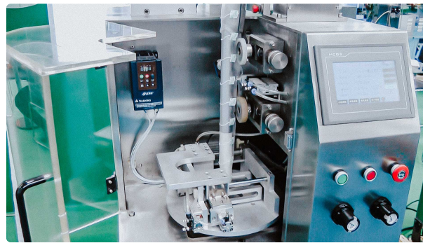
Automatic packing machine for packing tea in nylon pyramid with thread and label

Pharmaceutical Tablet Press · 26.11.2020 · 74.710K views