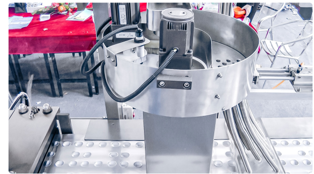
Automatic equipment for packing oval tablets into aluminum blisters in pharmaceutical...

Pharmaceutical Packaging · 24.09.2020 · 87.470K views